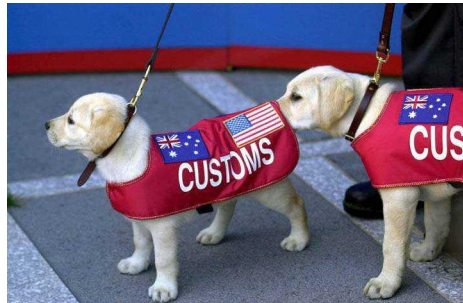
No One Is Above Suspicion