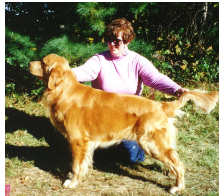
High Pastures Match, 1988 or 1989