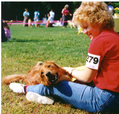
Minuteman Vocational School, Lexington, Fall 1988 or 1989